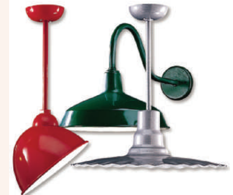
Reflecta RA stem-hung pendant in Red, RS wall mount in Green, and RW stem-hung pendant in Faceted Silver.