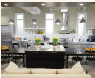
Reflecta silver dome pendants illuminate the kitchen of this industrial-styled loft in New York City.

▲ Luraline Lighting's Reflecta series of traditional, angled, tapered, and wave-style aluminum reflectors is available as cord- or stem-hung pendants; wall mounts with aluminum conduit arms in multiple sizes and styles; or post-mount fixtures with architectural-grade aluminum posts. Suitable for interior and exterior commercial applications, including retail, restaurant, hospitality, entertainment, healthcare, contract, and multi-family residential. Reflecta is offered with the latest in energy-efficient, eco-friendly light sources, including electronically ballasted compact fluorescent and HID, with optional diffusers. Available in the new Luraline palette of more than 50 powder-coated smooth, textured, and metallic finishes, plus the collection of classic RAL colors and custom color matching.