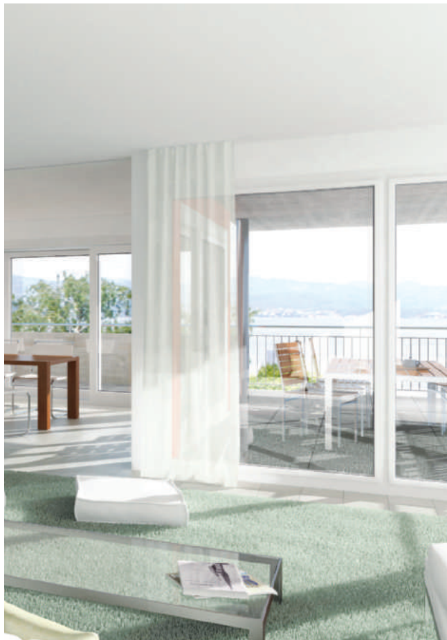
CLEAR VIEWS Häfele America Co.'s HAWA-Puro hardware system.

WHO SAYS HARDWARE CAN'T BE GREEN? Foundries are dirty operations, and their output accounts for only a tiny fraction of a building's environmental footprint. Yet hardware should still be selected with environmental factors in mind, such as benign finishes and easy, quiet operation. New hardware systems for all-glass doors, such as Häfele America Co.'s HAWA-Puro (right), help contribute to better visibility and daylighting. Specifiers can also use life-cycle studies to identify hardware with low embodied energy, recycled metals, and a track record of durability. Manufacturers with quantifiable details on plant operations, such as ISO 14001 certification or resource conservation programs, can be preferable suppliers.