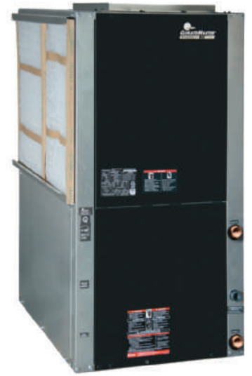
Greenbuild Booth # 3462