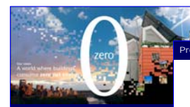
WBCSD Project: Energy Efficiency in Buildings